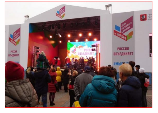
National Unity Day Stage, Outside Kremlin Walls, Moscow

However, we had some free time on Monday to observe the tail-end of the celebration of National Unity Day , the new holiday introduced in 2005 to replace the traditional Soviet one dedicated to the Great October Revolution on 7 November. Numerous events were held around Red Square and in other places in Moscow. Selected photos are shown below of a family-oriented concert and fair held just outside the Kremlin walls. The turnout was low relative to more established Russian holidays, but the participants appeared to be enjoying themselves.