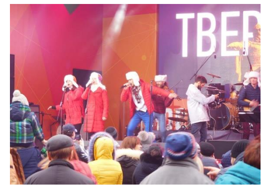
Band Singing "Ghostbusters" on National Unity Day, Moscow