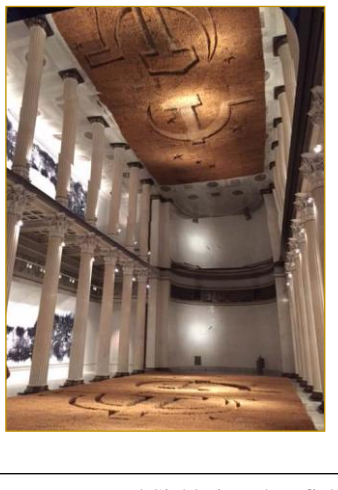
Hammer and Sickle in Wheatfield Reflected in Roof Mirror, Pushkin

Screen-Grab from Video of Proposed October Fireworks in Red Square