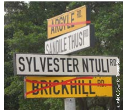
Street signs in Durban show changing preferences, while (left) Nigerian newspapers debated nationalist politics

The tension between traditional and modern ideas is also a theme of Wale's other main area of research – the role of the Nigerian Press in nationalist and ethnic politics. 'Since the 1990s I've been building a private archive of 20th century newspaper articles and looking at the intellectual leadership of newspaper proprietors and journalists in attempting to reconcile the principles of the European Enlightenment with emerging African colonial modernity,' says Wale. 'There's